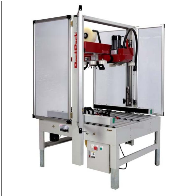
RQ Random Quad Drive

The BestPack® RQ Series Semi-Automatic Random Tape Carton Sealers are built for speed and rugged dependability. The 4 belt carton sealer system is a solution for heavy-duty applications. This heavy duty workhorse is ideal for those rugged and random sealing applications